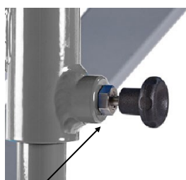
Standard Plunger disengaged Fig 3