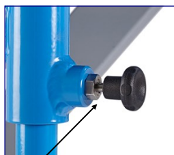
Plunger Disengaged Fig 2