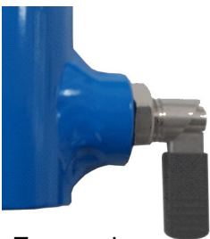
Engaged Fig 4