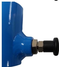
Engaged Fig 2