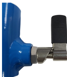
Flag Plunger Disengaged Fig 5

To raise the cot sides, hold the top rail in the centre and lift upwards. Pull and rotate the flag plunger until it snaps into the vertical downward position (Fig 4). Once partially turned the flag will snap into the notch at the bottom to be in the engaged position.