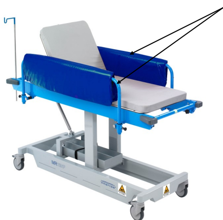
Fig 1 The trolley is fitted with raise and lower cot sides (Fig 1) these protect the patient during transportation to and from the ward.

Be aware of the pinch points when lowering the cot sides. These are indicated on the trolley.